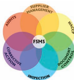
Integrated Approach to Food Safety Management