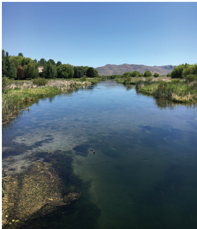
Near the headwaters of Silver Creek on the Purdy Ranch, a world-class, fly-fishing stream near Picabo, ID.