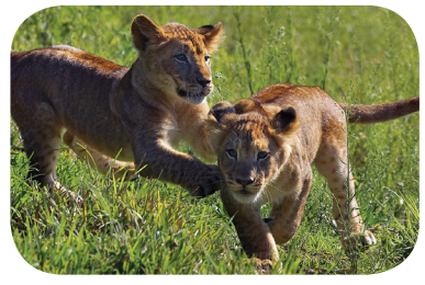
Torrey Pines Beach Looking North and Balboa Park Birds Eye View; Believe Shamu and Orca Whale Show; Lion Cubs.