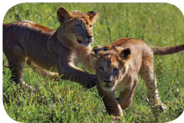
Torrey Pines Beach Looking North by Lisa Field and Balboa Park Birds Eye View by Joanne DiBona courtesy SanDiego.org; Believe Shamu and Orca Whale Show courtesy SeaWorld.org; Lion Cubs courtesy the San Diego Zoo.