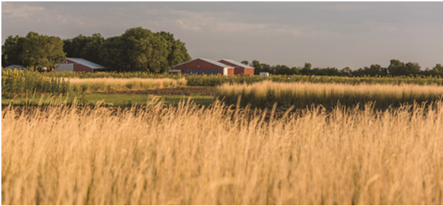
Fields planted with Kernza®.